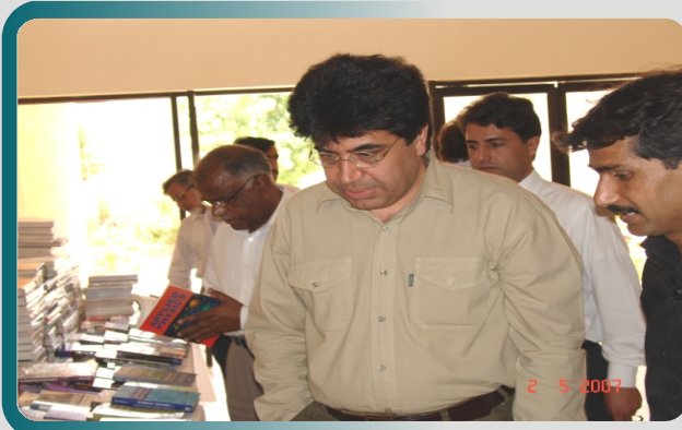
Another section of the exhibition

The speakers invited to speak on the occasion included very high profiled religious & political scholars which including: