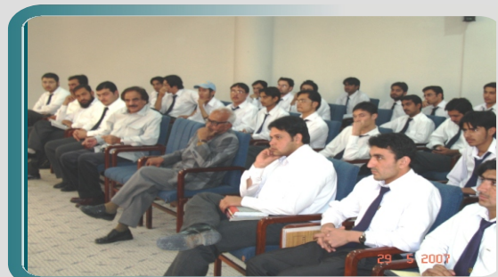
Audience engrossed in listening