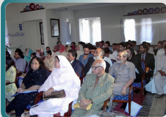
A section of the audience at the session