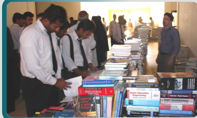
Students browsing the books on display

Reading is, in fact, a gateway to the world, the main objective of the exhibition was to campaign for and promote the importance of books not only among the students but also among the teachers in all fields of learning.