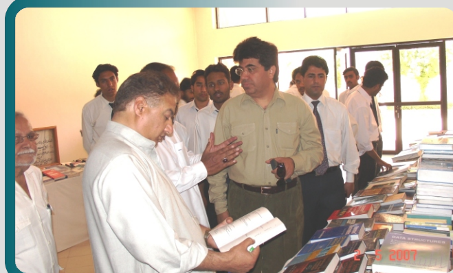
VC and faculty members looking at the books