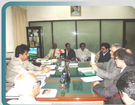
VC, BUIITMS exchanging views with the guests