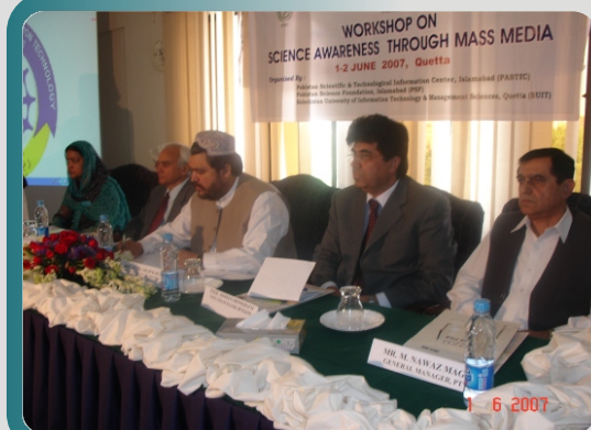
Chief Guest and the Organizers

As a mark of close cooperation among the Balochistan University of Information Technology and Management Sciences (BUI-TMS), Pakistan Science Foundation and its subsidiary organization PASTIC and the Media, a two day workshop was organized at the city campus of BUITMS on June 1-2, 2007. It was a unique occasion when a galaxy of prominent scientists, educationists, and media organizers were seen together, engrossed in meditating how to evolve effective means of educating the general masses on the need of scientific facts, know-how and attitude.