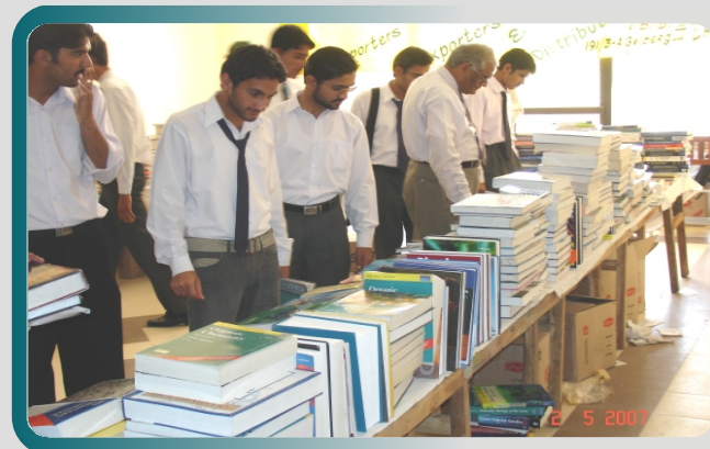
A view of Books displayed at the Exhibition

Balochistan University of Information Technology and Management Sciences (BUI-TMS) has always been initiating constructive programs in order to stimulate the students to achieve high goals in their careers. In the same context, a book exhibition was held May 2-4, 2007 at Takatu Campus of BUITMS.