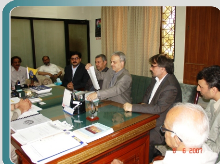
Iranian officials in VC office