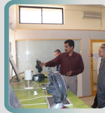
Iranian Delegation being briefed about Solar Project