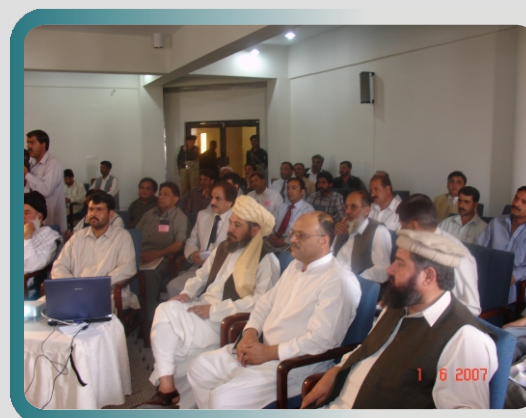
A section of the audience at the seminar