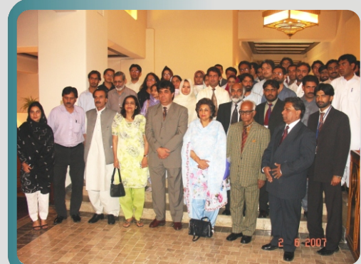
Group photo of participants with VC, BUITMS