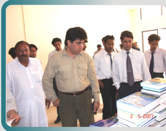
A View of a section of the exhibition