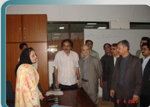
Delegation in the Electronic Lab

The group was then taken on a round of the city campus, where they were pleased to see the students engrossed in making the best use of the well stocked library facilities, academic work going on in the classes, practical work in progress in the computer labs and the cutting edge research work going on in the bio-tech laboratories.