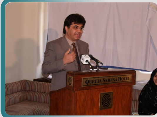
VC, addressing the audience

The session was started by getting a brief introduction from the participants, their profession, their strengths and weaknesses.