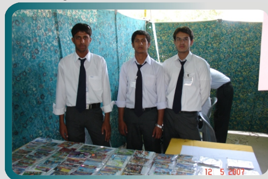
A CDs stall at the festival

Different stalls to attract the people of different interests were setup. There were twenty four stalls including food stall, songs and flower dedications stall, computerized and verbal palmistry, lucky 7 and Tambola, Bangles and mehndi stalls. etc