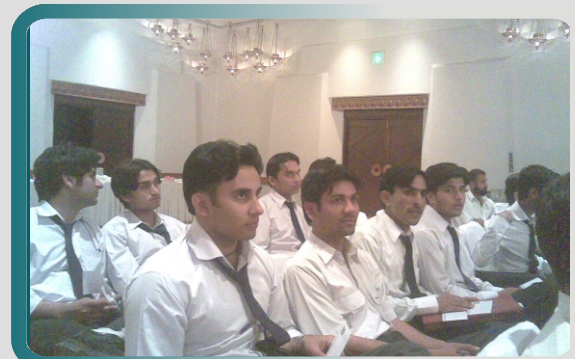
BUITMS students attending the seminar

Allama emphasized on the need for mutual understanding among the Religions, Communities, tribes and at individuals. He said people are creating enemies by themselves as labeling them as this is my enemy & that is my enemy with out any reason which is wrong.