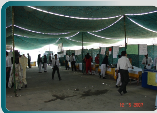
A panoramic view of the stalls

With the same considerations in mind, fun fair was again organized at BUITMS city campus by the cabinet of dramatic club BUITMS after a period of 2 years. Preparation for the fun fair started with posters and banners pasted all over both the campuses (city and Takatu) in order to advertise the event. As the day of the funfair got nearer, an air of enthusiasm, excitement and participation could be felt and seen among the students. Dramatic club BUITMS arranged meetings to take decision regarding where it should be held, what ingredients should comprise it, how to decorate it, how to promote it and how to make it successful. Groups of Members could be seen working almost every where on the campus busy in making charts for advertising, banners and different stuffs for its promotion. To get the work started the financial reserves in the accounts of Dramatic club were utilized. Cards were distributed among the participants and organizers and the tickets were required to enter into the premises for the visitors so that any unpleasant happening could be avoided. Besides them other student show their interest to support the event's success as a participants.