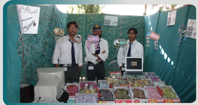
A Bagles stall at the festival