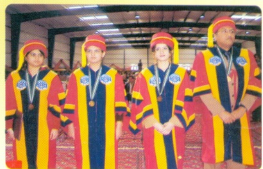
Gold Medalists standing tall