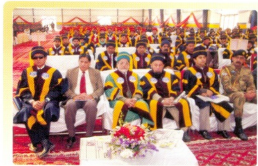
Faculty members at the Convocation