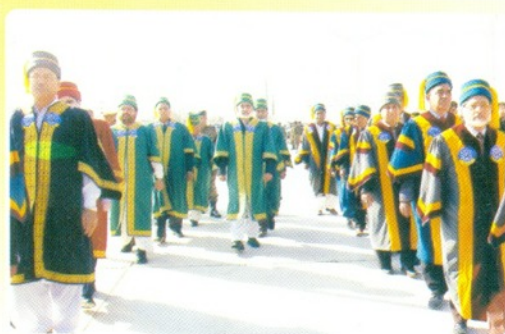
The Guest of Honor being escorted to the Convocation Hall

The 2 nd Convocation of BUITMS was another landmark in the history of BUITMS as it projected the realization of a dream of students of BS(CS), BS(CE), BS(BA), MBA(Regular) and MBA(Executive) who were to be conferred upon with the degrees in their respective fields.