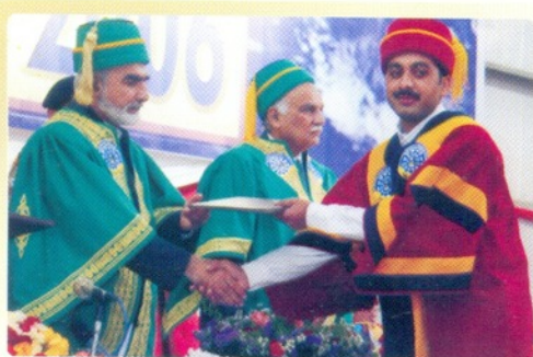
Governor conferring degree upon a passing-out graduate