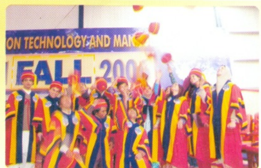
Jubilant graduates after receiving degrees

Later the member of Faculty and celebrities were presented with university shields.