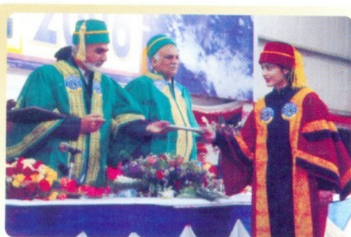
A passing-out graduate receiving degree