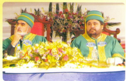
Governor & Speaker Balochistan Assembly

The distinguished graduates who got top position in their respective program of study were awarded gold medals on their Herculean achievement. The gold medalists were: