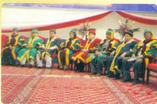
Deans & some of the guests

He concluded his speech by once again thanking Mr. Chancellor and wishing the passing out graduates best luck in the future.