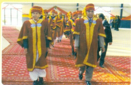
Registrar & Controller Examination leading the Procession

November 30, 2006 was a colorful day when the passing out graduates assembled in front of the prestigious Expo-Centre, Takatu Campus, robed in their traditional red colored gowns and oriental caps of scholars. Their faces were shining with delight and satisfaction upon their achievements in their professional fields. The faculty members were also robed in their traditional blue and green gowns thus making the whole event an extravaganza of colour and light.