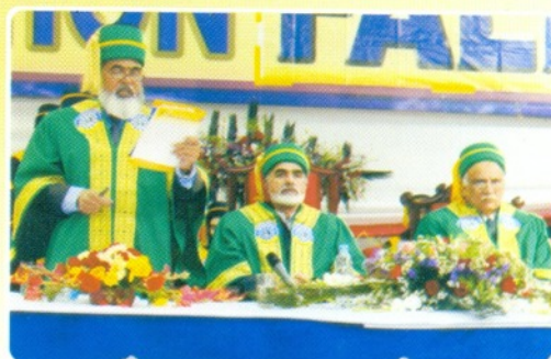
VC requesting the Chief Guest to open the Convocation

On the arrival of the procession in the Convocation Hall, the national anthem was played. Following which the Vice Chancellor Baluchistan University of Information of Information Technology & Management Sciences requested the Chancellor to declare open the 2 nd Convocation of BUITMS to which he consented delightfully and declared open the convocation.