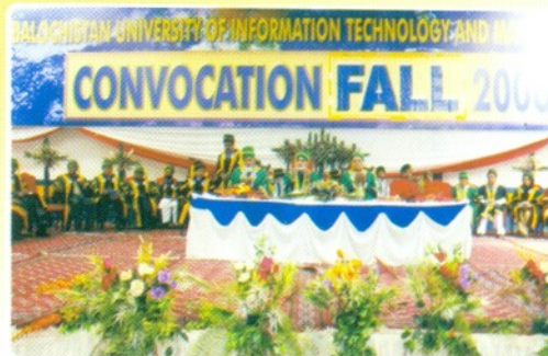
A view of the Centre stage

The academic procession was led by the passing out graduates followed by the faculty members in ascending order of their status i.e. Research Associates, Lecturers, Assistant Professors and Professors. The dais was bedecked with the presence of Syndicate Members, Registrar, Controller Examinations, Vice Chancellor and the guest of honor- Mr. Owais Ahmed Ghani, Chancellor BUITMS.