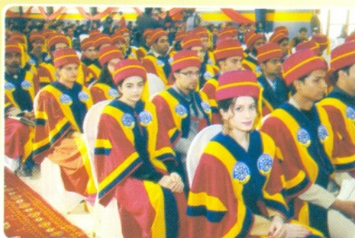
A section of the passing-out graduates