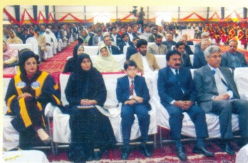
Some prominent figures seen at the Convocation