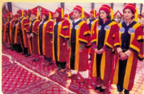
A batch of BS Computer Science graduates

He said that this university was announced by the president Pervez Musharaf as a gift for the people of Balochistan in February 2001 and since its inception it has not lost a single day of productivity, this has yielded the results in the form of passing out graduates today. He highlighted the facilities presented to the students and programs offered at the institution.