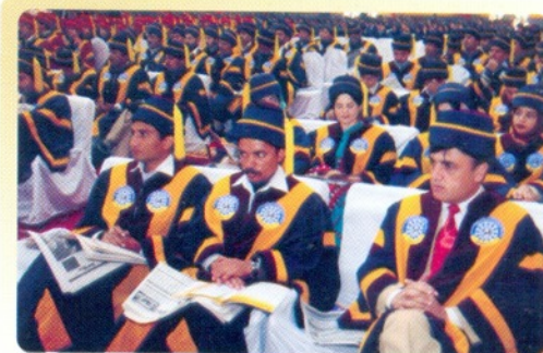
Faculty Members during the Convocation

The VC BUITMS said: We want this university to have 50,000 students by 2025 from all over Pakistan and all over the world. I am sure to realize our vision you are with us HEC is with us and Government of Pakistan is with us.