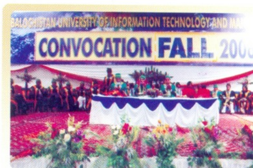
Governor & VC making Dua'a

The VC BUITMS said: We want this university to have 50,000 students by 2025 from all over Pakistan and all over the world. I am sure to realize our vision you are with us HEC is with us and Government of Pakistan is with us.