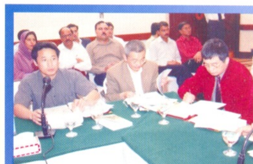
Delegation from China at the seminar