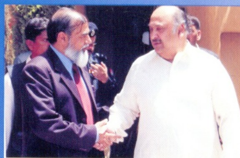
VC, BUITMS welcoming the CM

The inaugural session was presided over by Jam Muhammad Yusouf, Chief Minister of Balochistan. In his keynote address, he categorically stated that the province is geared up to play an important role in the economic development of the country.