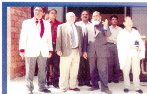
VC talking to the Ambassador of France