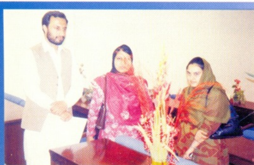
Prize-Winning flowers arrangement

The importance of flowers in human life moved us to hold a flower exhibition. The exhibition was presented by 'Dramatic Club' on 4th of May 2006, at Takatu Campus. All the students of the City and Takatu Campuses were very excited to participate in this colorful competition. Students presented different types of flowers with different traditional touch. This exhibition started from 11:00 am till 03:00 pm.