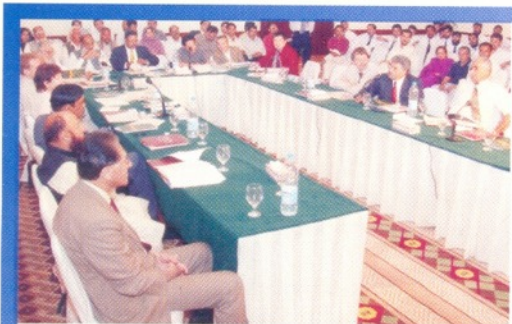
A Section of the main participants

The inaugural session of the two-day international seminar was held on the colourful morning of May 8, 2006. A large number of people belonging to the various fields of life along with the faculty members and students from BUITMS added colour to the seminar for two full days through their regular attendance.