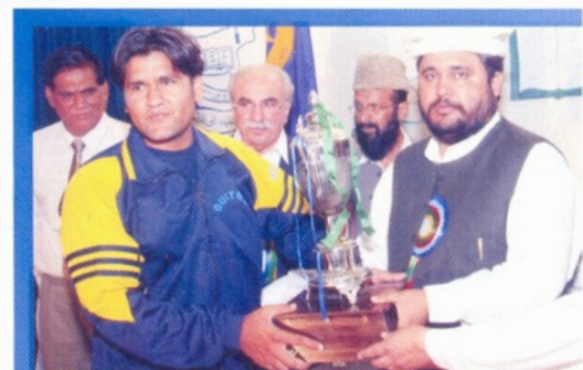
Speaker Balochistan Assembly awarding the Champions Trophy to BUITMS Captain