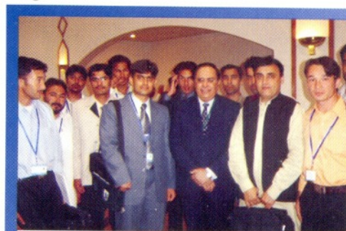
BUI-TMS team with Dr. Atta-ur-Rehman

It is the call of time to emphasize the need for consensus through dialogue among the youth on critical issues of national importance as well as to create a sense of participation among the students in the formulation of national policies. It is in this context that the Higher Education Commission, with the basic idea coming from none other than President Pervez Musharraf, organized the first National Students' Convention in May 2004. Its success made it into an annual event as it now plays a constructive role in national dialogue and intellectual interaction. Students' Convention 2005 was the second in the series with 95 students from all over the country participating on the basis of their talent and their ability to express themselves through public speaking.