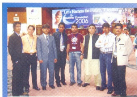
BUITMS delegation outside the convention centre

Themes for the Students' Convention 2006 were: