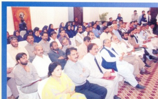
A Section of the audience at the inaugural session

Balochistan University of Information Technology & Management Sciences (BUI-TMS) in collaboration with the Hanns Seidel Foundation (HSF) Islamabad, played an important role in organizing a two-day international seminar on “Economic Development Strategies for Balochistan: National, Provincial and Regional Dimensions” on May 8 – 9, 2006. The seminar attracted various scholars and experts from different parts of the country as well as from abroad including China, Germany, Russia and Oman.