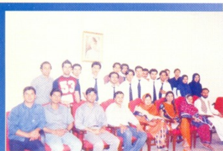
A new cabinet of Dramatic Club

Students drew very exciting sketches and paintings related to the given topic with different looks, aspects, and designs. Judges were also invited; it was they who announced the result of Poster exhibition and Flower exhibition. The judges were: