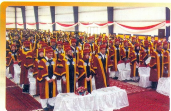
The convocation congregation

The BUITMS has been strengthening its PhD Program in areas of particular relevance to Balochistan and Pakistan. I must warmly congratulate the staff and the students on their collective contribution towards the success of the University. Today we need an educational system which can produce "Muslim philosophers, Muslim scientists, Muslim economists, Muslim Jurists, Muslim Statesmen, in brief, Muslim experts in all fields of knowledge who would reconstruct the social order in accordance with the tenets of Islam."