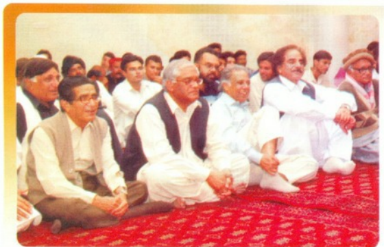
Audience absorbed in the Mushaera