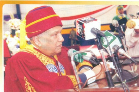
Syed Sharifuddin Pirzada addressing the University mob