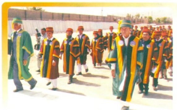
The Academic procession