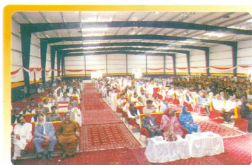
A panoramic view of the convocation Hall