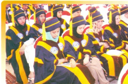
A section of the academic congregation

The morning of 28 th of April, 2006 witnessed colorful festivity when the passing out graduates assembled in front of the spacious Expo Centre, Takatu Campus, robed in their bright and colorful gowns and oriental caps of scholars. Their faces gleamed with the satisfaction of achievement and the prospects of starting dazzling careers in their professional fields. On the other hand the faculty members, both young and old appeared in their graceful robes, distinguished by their magnificent attires.