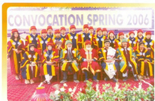
MBA, MBA (Executive) Groups

He highlighted the importance of the historic occasion. He was proud of the fact that the initial round had been completed with flying colors. He expressed his optimism for more rewarding achievements. He described the establishment of linkages with prime institutions of the world as the launching of an enterprise towards universal recognition.