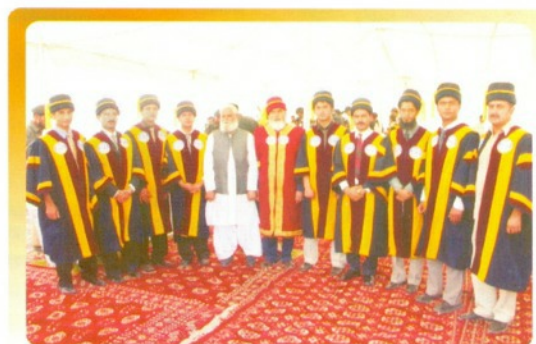
VC and father of Gold Medalist with faculty of computer science

Helen Keller once said, "Life is either a daring adventure or nothing at all". One needs not be ashamed, if some unusual thought occurs to him/her. It is even desirable to think wildly. It would not hurt to think most stupid thing you would dream of doing as a scientist, as an engineer, and as a business person or as a husband or wife in your personal or professional life. "if at first the idea is not absurd, then there is no hope for it" said Albert Einstein, and "probable impossibilities are to be preferred to improbable possibilities," said Aristotle, "Everything that looks great now, once seemed impossible" says a Chinese proverb. Everyone must be perpetually geared by the drive to excel. Fresh ideas must be generated, since ideas alone are imperishable. If the creativity packaged in the human genes is strengthened by the enabling environment we will be able to cope with our growing pains the illiteracy, the disease, the environment. Genius is a strategic advantage which elevates the nations to the pinnacle of glory. Every one of us has genius within and we just need to explore and exploit our hidden resource of genius.'