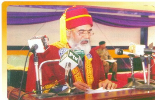
VC-BUITMS delivering his Maiden-Convocation Speech

the power to think and decide his own plan of action. That is why Allah Almighty directed the angels to bow before 'Man' as a mark of acceptance of his superiority.