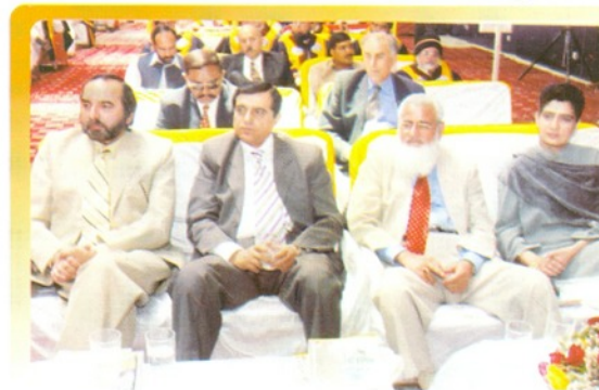
Some of the prominent guests