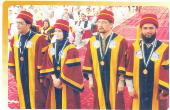
Group of Gold Medalists

The Honorable Vice Chancellor, his face aglow with delight, conferred the respective degrees. It was enthralling to see young men and women, proudly marching on to the stage and receiving their degrees from the Chancellor and the Vice Chancellor. The graduates, who had distinguished themselves by notching top positions in various programs of study, were awarded gold medals. Four students honored with the award of gold medals were: